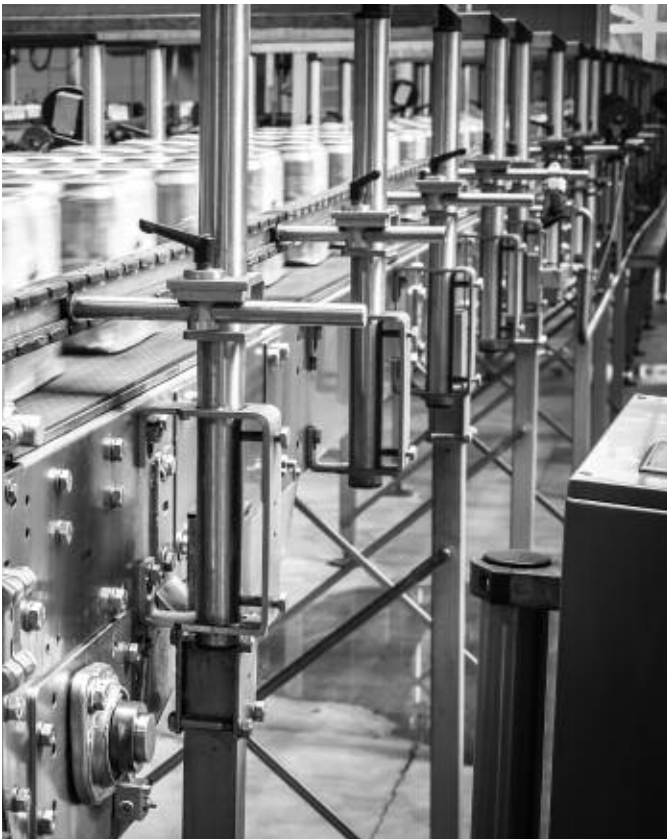
▲ Common applications for adjustable handles.